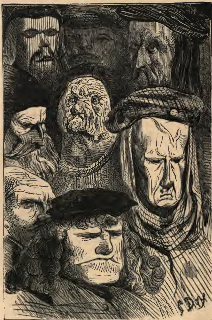
The Physicians and Master Surgeons.